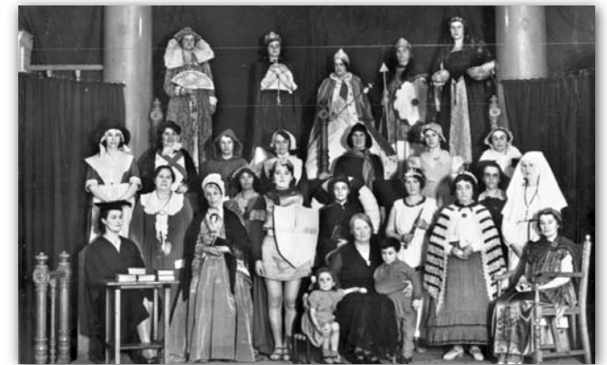
Fancy Dress Pageant at the Congregational Chapel